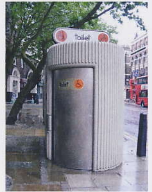
Nearly 60% of those we surveyed reported that they would not use an Automatic Public Convenience

37% of respondents didn't have or had never heard of the RADAR key scheme, and 44% reported that venue opening times prevented them accessing RADAR locked toilets. 6% of those surveyed reported being unable to use accessible toilets when needed due to their use by 'able-bodied' people. Yet 13% of those with hidden disabilities reported being challenged when using the accessible toilet. Our thanks to ITAAL and it's members for allowing us to analyze and use this information.