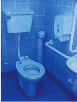
Toilets illuminated by blue lights deter substance use, but make facilities inaccessible for many people with a range of disabilities