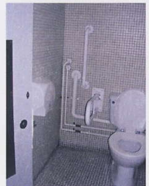
89% of ITAAL respondents under 35 cannot use the current standard for accessible toilets due to lack of space